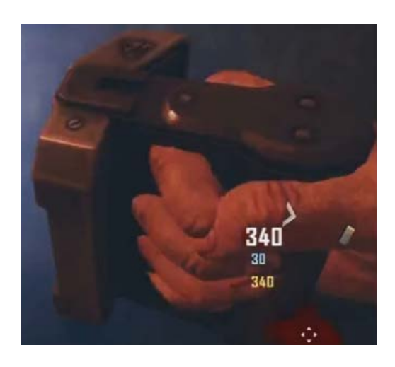
Comparison of P.S. Products' Patented Design (top) with Image of Activision's Virtual Weapon (bottom)

"A number of enforcement efforts have recently shed light on how patents, copyrights and trademarks may protect against virtual design theft."